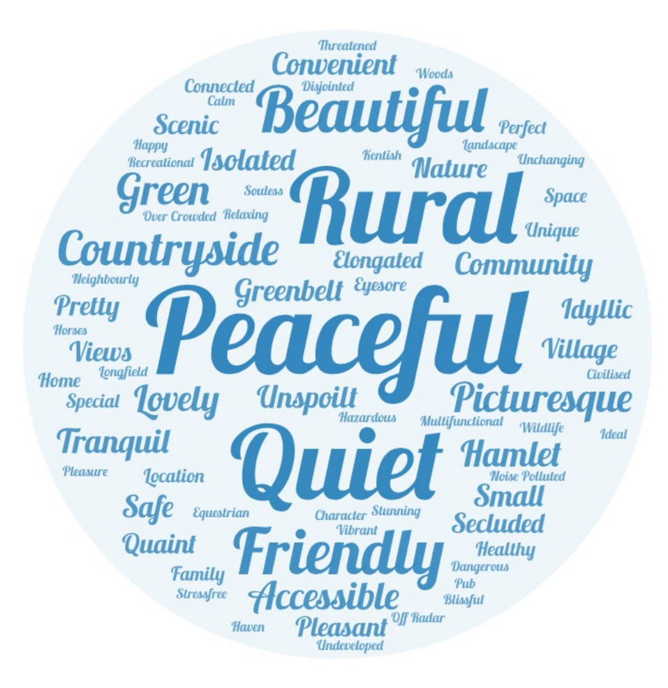
Figure 1: Words used to describe Fawkham Parish

The result are shown in the picture below, with the size of a word representing how often it was used.