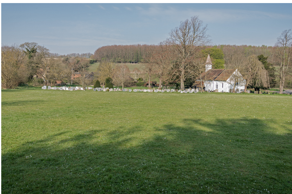
Baldwins Green Conservation Area, looking west to Churchdown Wood