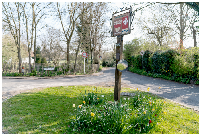
Baldwins Green Conservation Area, looking north

Baldwin's Green itself is a small triangle of open space at the junction of Castle Hill and Fawkham Road. It is subject to the protection under section 9 of the Commons Registration Act 1965, as found on 28.3.1979 by the Commons Commissioner.