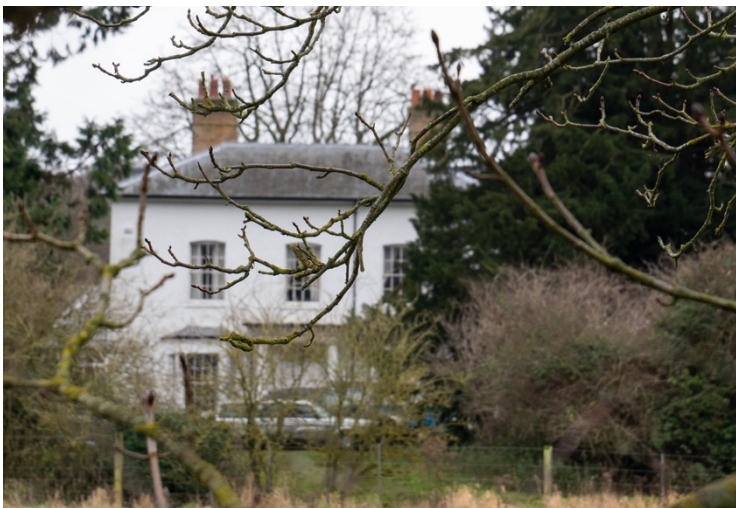
The White House

Historic England listing information: Built about 1722 and refaced in the early C19. Originally called Hook House, later Russell's Farm, later again Hook Farm. Two