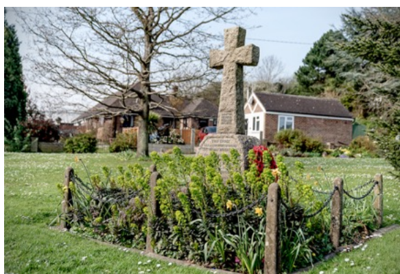
Fawkham War Memorial