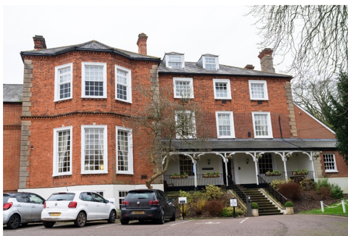
Brands Hatch Place

Wooden verandah to ground floor of set back portion. Right hand side has ornamental mid C19 glass and iron conservatory.