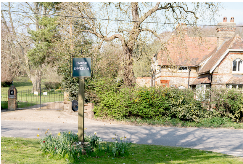
Beech House and Laurel Bank

The development of the area has given rise to a small number of buildings from different periods each with its own architectural style. A variety of building materials and finishes have been used and most buildings retain their locally distinctive character, for example, Beech House and Laurel Bank are constructed of flint with brick relief to the openings, brickwork quoins and bands of horizontal brickwork.