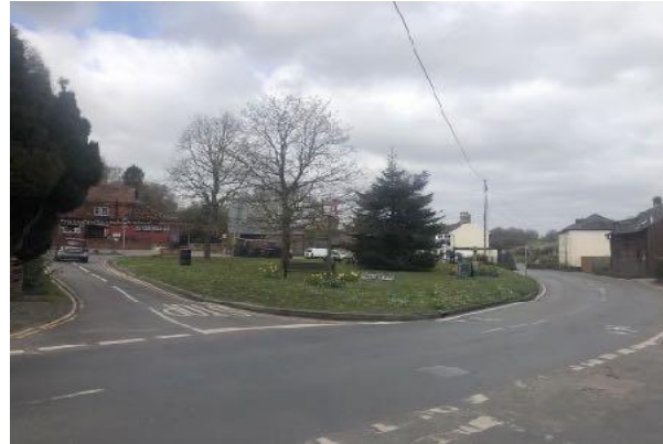
Noticeboard at Village Green (3/20)