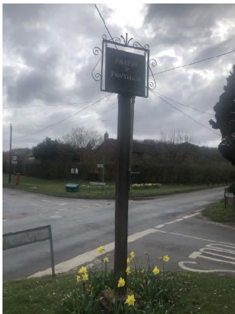
3/20 Village sign: note fading Village Green (3/20)