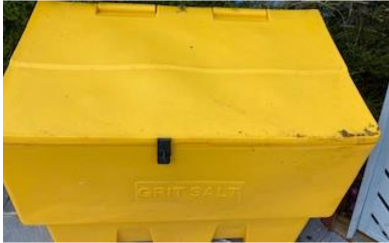
4/20 Salt Bin Village Hall