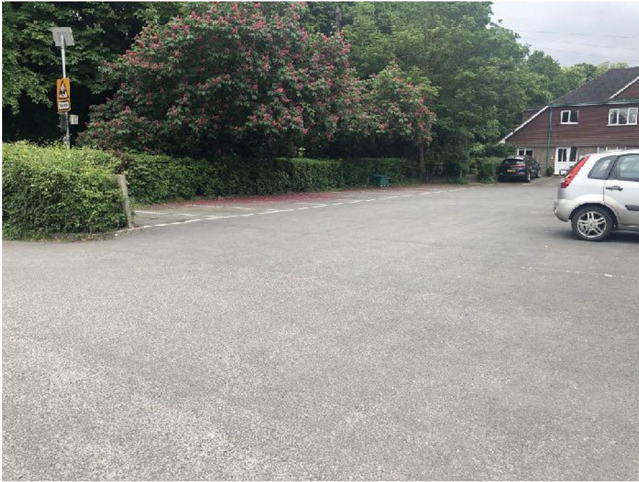
5/19 Village Hall car park and salt bin