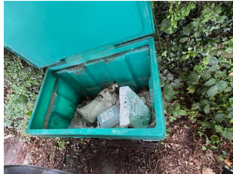
6/22 Salt Bin at Village Hall