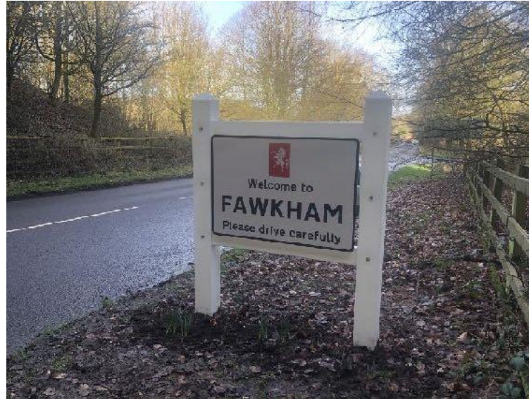
Rogers Wood Lane triangle (4/21)