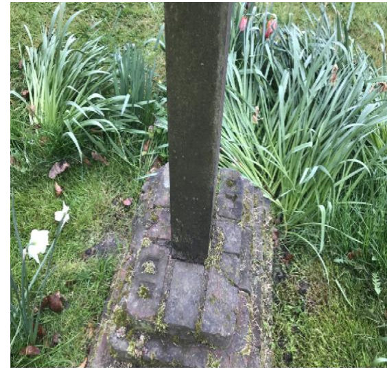
Village Sign at Baldwin's Green (04/20)