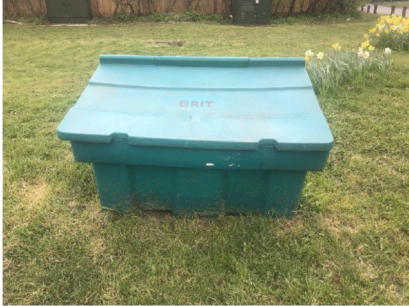
3/20 Salt Bin at Fawkham Green Road Fawkham