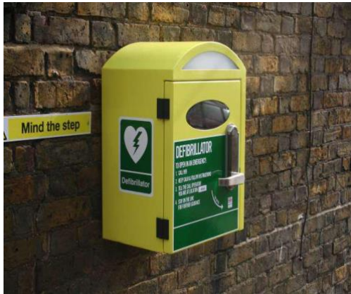
Automated External Defibrillator at Rising Sun Inn Public House (March 2016).