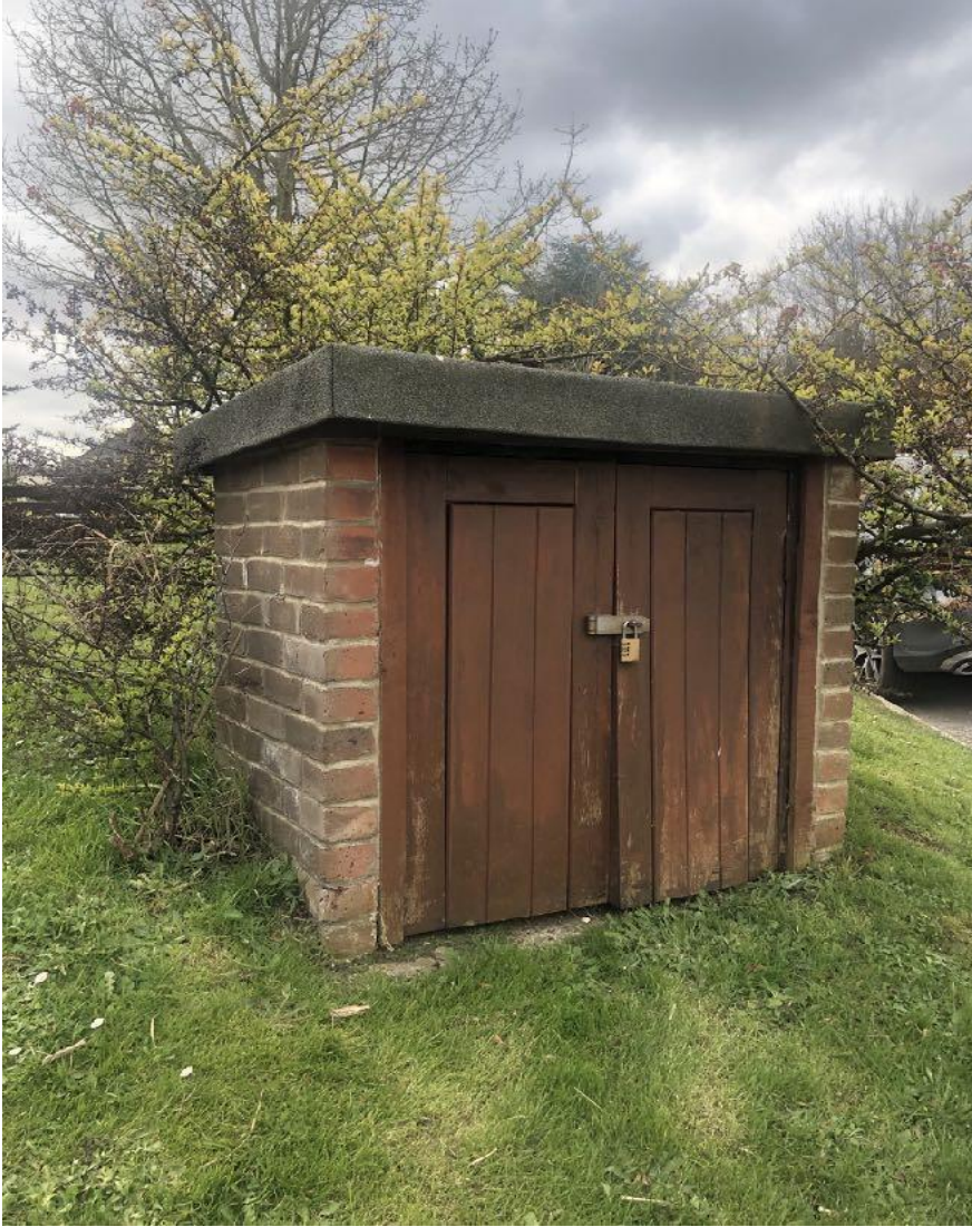
Electricity box (3/20) and Christmas Lights (12/19)