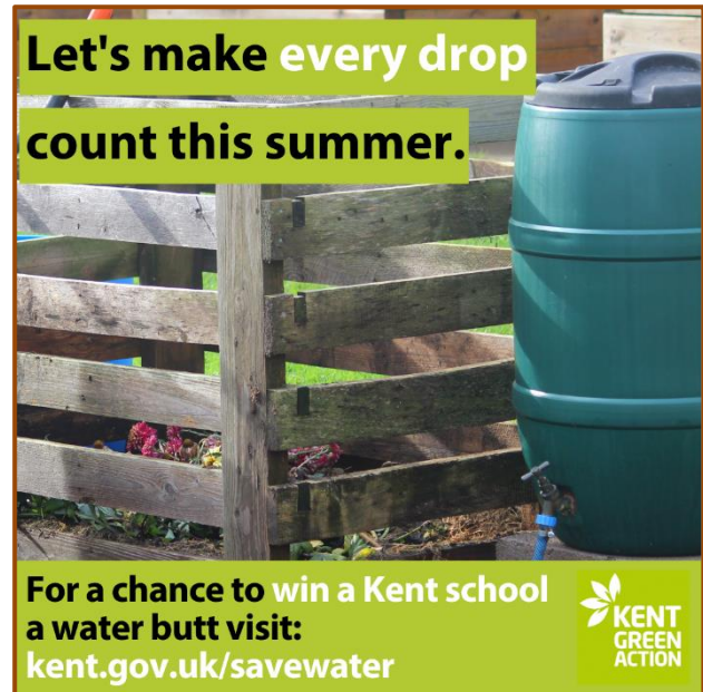
Example campaign post

There is also the opportunity to nominate your local school for the chance to win one of 10 water butts donated by the water companies. Entries close on 16 th September so visit www.kent.gov.uk/savewater to nominate your local school and follow Kent Green Action on www.facebook.com/KentGreenAction/ or www.twitter.com/KGA_KENT for news and tips.