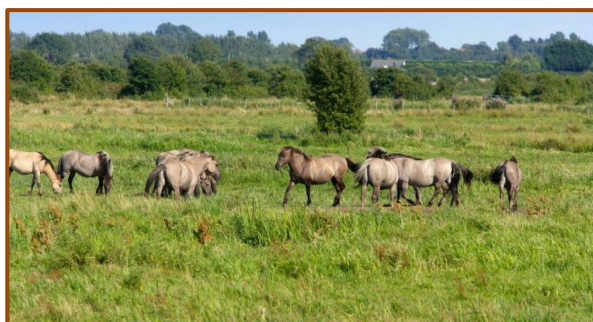
Iconic species in Kent: Painted Lady butterfly and Konik horses